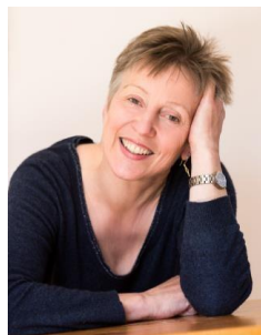
LITERARY CREAM TEA, 21 March