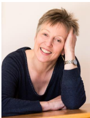
LITERARY CREAM TEA, Saturday, 21 March